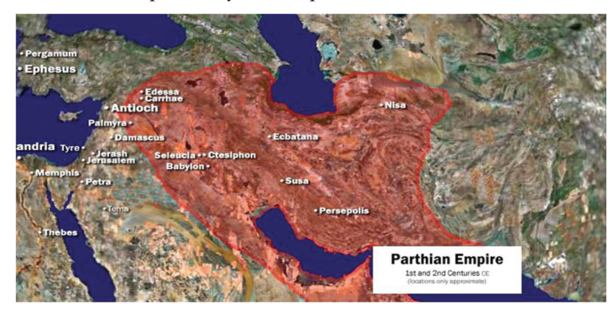
MAP 1 Parthian empire

After the fall of Medes their territory (Map 1) had been reduced and finally until the Achaemnenid had been changed to a satrap. Medes in the Parthian time according to of Isodore, had been divided to Ragha Medes and Upper Medes. As the Isodore has shown Upper Medes has bounded to Armenia in the north and Ragha in the east and in the west to Mesopotamia, in the south to Susa. Isodore did not mention about the governor of these two satraps, but we may conclude that the capital of Medes Ragha was a city of Ecbatana. Naturally, the several silver mines were used by Parthian as a mint house to issue many coins.