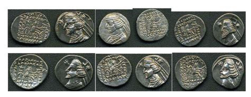
b) Phraates IV