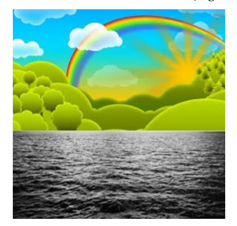
Figure 1. An illustration of tripartite structure of the Universe: Sky-Earth-Sea (Black Waters)

Moreover, the Sea is perceived as an image of underworld with chaotic waters that surround and limit the Universe from all sides (Ter-Poghosyan, 1911). The chaotic waters or the Space Ocean images are also reflected in Armenian folk traditions recorded in the 19<sup>th</sup> century. In Alashkert Province (Western Armenia) people believed that between the heavens and the Earth there was a deep ocean "Black water", which was set for Earth punishment, and once it could spout out from its shores and destroy the Earth as it was in the time of flood (Figure 1).