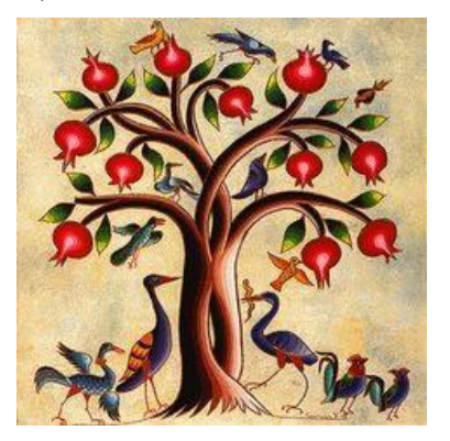
Figure 2. Pomegranate Cosmic Tree with animals

more vivid in Jan gyulums (folk songs), plays, epic, and so on, which was subsequently mixed with religious and spiritual views. Kenatz Tzar is known as a religious symbol and was drawn on walls of fortresses and carved on the armor of warriors. The branches of the tree were equally divided on the right and left sides of the stem, with each branch having one leaf, and one leaf on the apex of the tree (see Figure 2).