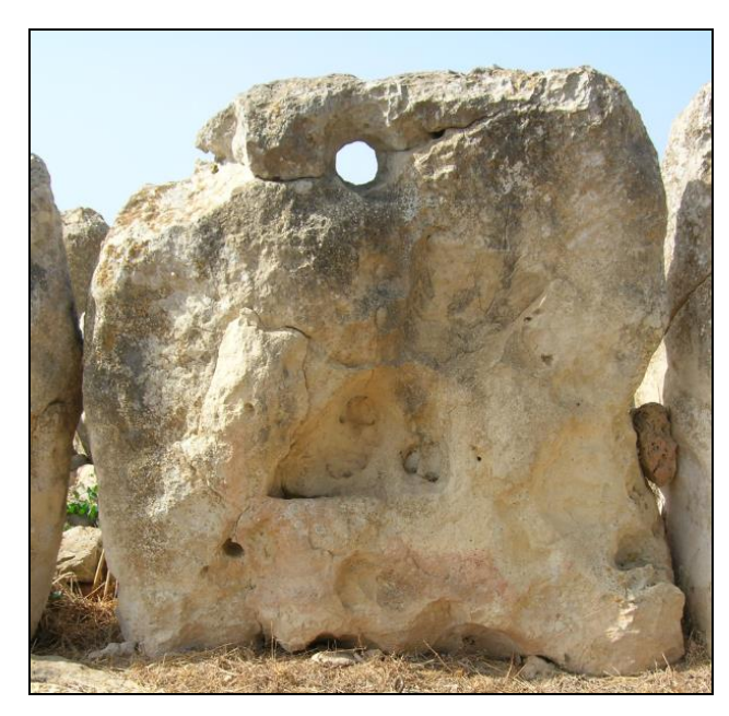
Figure 2. The fourth orthostat of the outer wall of the Main Enclosure.