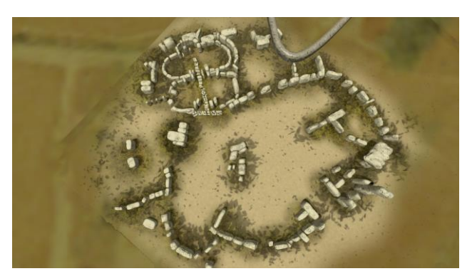
Figure 3. Virtual interactive model of the Borg in-Nadur temple (Stanco and Tanasi, 2013).