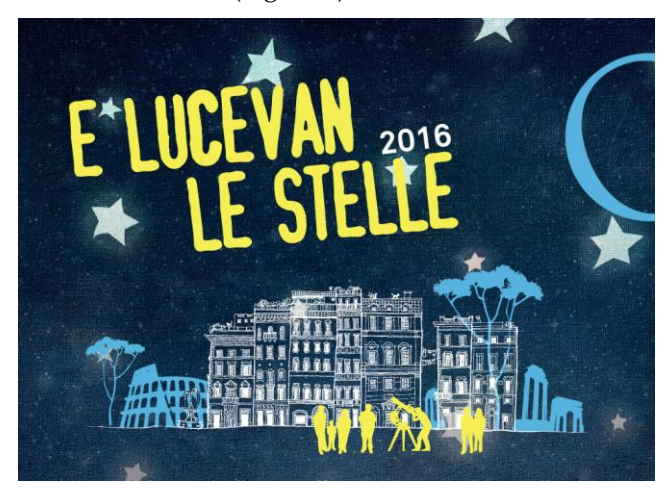
Figure 1. The promotion banner of the event E Lucevan le Stelle.

and abroad, amateur astronomers, students, children and their families (Figure 1).