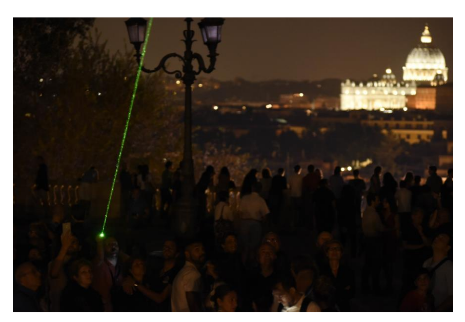
Figure 4. A guided tour of the night sky during the observing session of August 10, 2016 at the Pincio Terrace. Note the public street lamps switched off for the event.