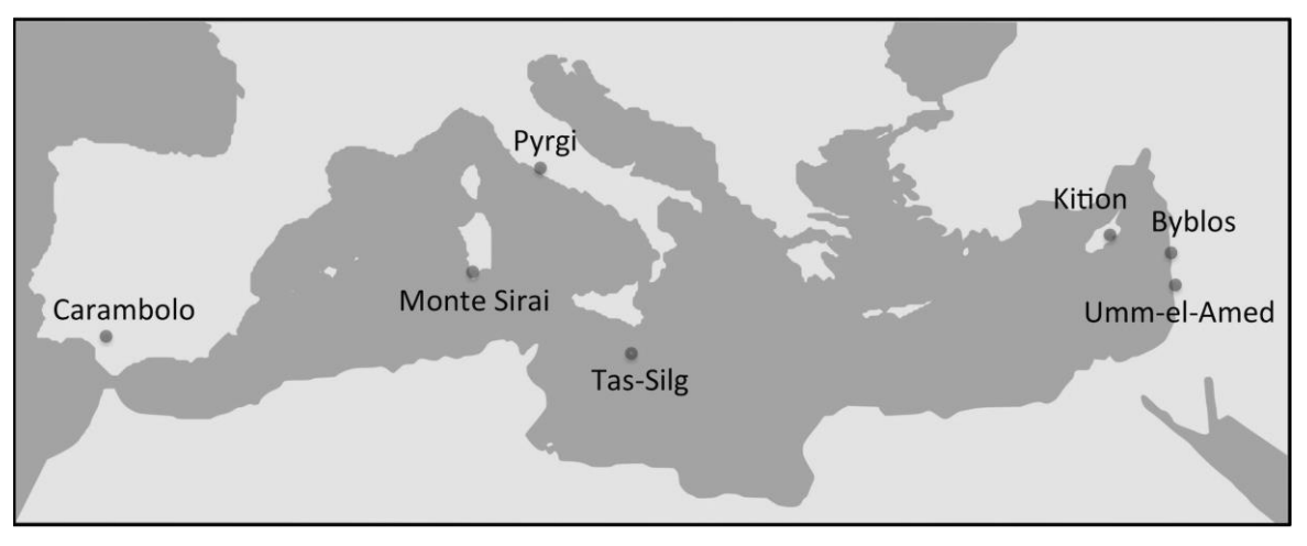
Figure 1: Geographical distribution of the temples studied in this paper.

Bamboula site has a temple dedicated to Astarte, built in the IX BCE, the largest Phoenician temple known up to date. It has an orientation rather close to the east-west direction and its entrance is facing the east (Aubet 1987: 42-44).