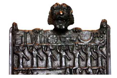
Figure 3. Particular of the Lamaštu bronze plaque kept at the Louvre (AO 22205)

The successive paragraph describes these seven beings through a series of epithets and images usually associated with demons (Verderame, in press (b)). The animal traits attributed to the Seven in this early tradition remained in their iconography, known mainly from the plaques against the Lamaštu demon (fig. 3), where the Seven, together with the "king" of the demon hordes, Pazuzu, are summoned to fight against the Lamaštu and drive her back to the Netherworld.