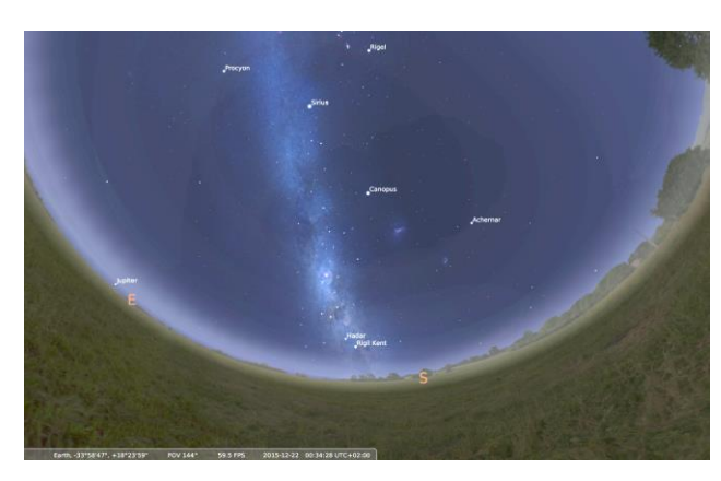
Figure 4: Milky Way in December (Summer). Stellarium image of the Milky Way aligned roughly South-North in Summer, as seen from Carnarvon (Latitude 30°58'05" S, Longitude 22°07'58" E, Altitude 1249 m) at a time of about 00:30. The later time is used because the Sun sets later in summer. The shorter nights also mean that the Milky Way does not have enough time to rotate to an East-West alignment.