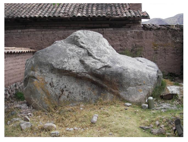
Figure 6. Huaca in the Palace of Huayna Capac, Urubam-

The Torreon of Machu Picchu is an example of a huaca animated by the sun and by water flowing in the adjacent stone-lined channel (Malville 2015a) (Figure 7). A window in the tower allows sunlight on June Solstice to touch to top of the rock around which the huaca has been built. The cave at its base, the Royal Mausoleum, symbolic of the lower world, containing large niches and non-functional steps is also illuminated by June Solstice sunrise. Multiple interpretations of this prominent feature may all apply: a powerful huaca, a miniature version of Huayna Picchu, and a solar observatory.