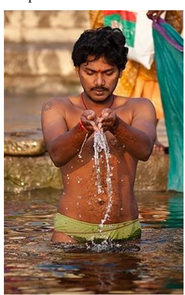
Figure 3. Surya Puja in Varanasi

In Darshan direct eye to eye communication takes place between the deity and the devotee. Eyes of the deity and of the viewer are all important. When a new image of a deity is made, the eyes are final stage in the creation of anthropomorphic figure. They finally are ritually opened with a golden needle or the final painting of the eyes, and the image comes alive. Sometimes the coating of honey and gee covering the eyes are removed at the time of consecration of the image. Sometime when the temple containing the sacred image of the deity is itself consecrated the priest or architect will climb to the top and open the eyes of the temple also with a golden needle, thereby animating the temple.