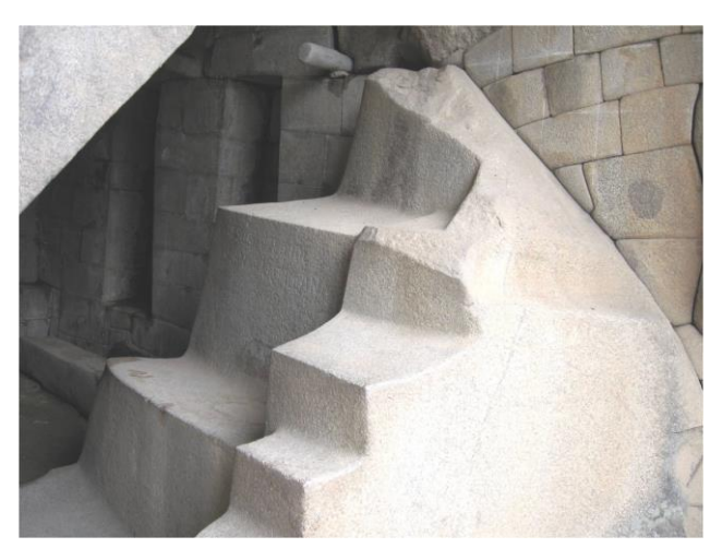
Figure 7. The Royal Mausoleum at Machu Picchu

The Torreon of Machu Picchu is an example of a huaca animated by the sun and by water flowing in the adjacent stone-lined channel (Malville 2015a) (Figure 7). A window in the tower allows sunlight on June Solstice to touch to top of the rock around which the huaca has been built. The cave at its base, the Royal Mausoleum, symbolic of the lower world, containing large niches and non-functional steps is also illuminated by June Solstice sunrise. Multiple interpretations of this prominent feature may all apply: a powerful huaca, a miniature version of Huayna Picchu, and a solar observatory.