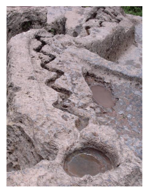
Figure 5. Huaca Kenko

flowed. (Figure 5) The large palace, Quespiwanka, of Huana Picchu contained a large plaza with a large white, uncarved stone in its center, watered by a stone-lined channel. (Figure 6) From that huaca the sun can be seen rising at June solstice between stone pillars on the distant horizon.