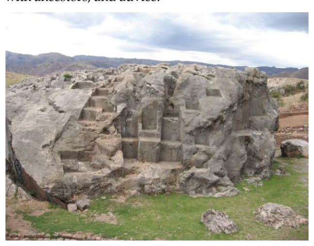
Figure 4. Huaca Piedra Cansada

landscape features continue to be viewed as animate and responsive to human attention, engage in reciprocal relationship with human through offerings, annual pilgrimages, and evocations. Many if not most of the stone huacas of the Inca world were associated with water, which together with the sun, would bring them to life and maintain them as living beings (Salmon 1991, Salmon and Urioste 1991, Malville 2009). Huacas depended upon humans for water, the sun for light, and, in turn, humans depended upon huacas for protection, connections with ancestors, and advice.