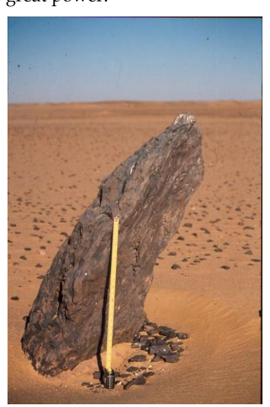
Figure 2. Nabta Playa Monolith

These stars may have been much more than mute direction markers on the horizon, but living beings with their own personalities, their own stories, and purposes, who established reciprocal and interdependent relationships with the nomads. The standing monoliths, each facing north, have shaped shoulders, appearing as if they are representations of people, perhaps departed nomads. When the playa was flooded following June solstice, the feet of the megaliths would have been in water, which may have brought them to life. No longer would they be representations, but actual people. Water, stones, people, and stars may have been experienced as a network of relationship and reciprocity: in their rain making rituals, people summoned water into the playa, which animated the ancestor stones aligned with the powerful stars. The lives of the nomads depended not only upon water for themselves and their flocks, but also upon the stars that guided them across the Sahara and those stars must have seemed to possess great power.