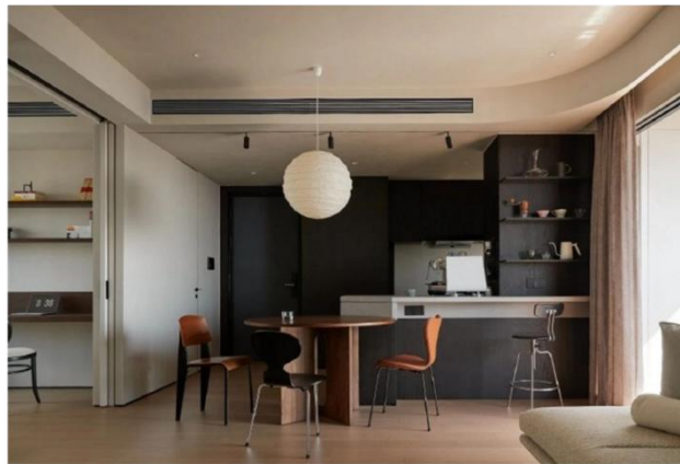
Fig. 2 New Chinese home design

Through the clever use of lines, the new Chinese home design not only retains the essence of Chinese culture, but also incorporates modern design concepts and elements, showing a classical and fashionable style. This design style makes the home space more cultural flavor and artistic taste. Figure 2 is a typical new Chinese home design.