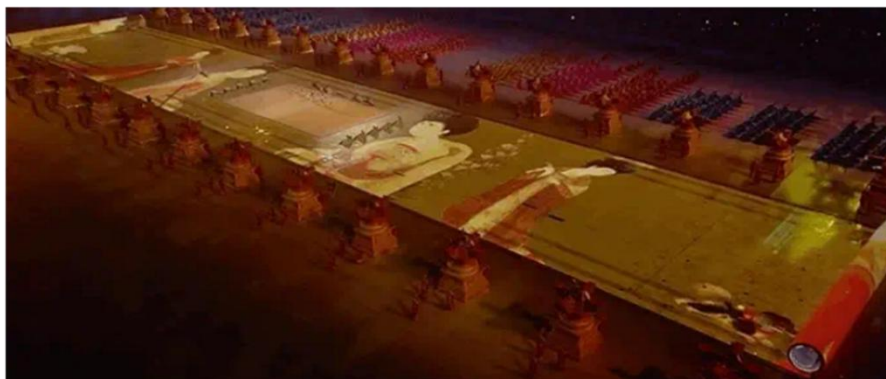
Fig. 4 Application of artistic elements of contextual beauty in ink scroll design

Also analyzed on the basis of the ink scroll design of the opening ceremony of the Beijing Olympic Games, the designer creates the beauty of the real and imaginary situation through the technique of leaving white space. The ink pattern on the scroll and the blank part reflect each other, forming a strong visual contrast and sense of hierarchy, so that the audience can feel the unique flavor of ink painting and aesthetic interest in the appreciation process. Specifically as shown in Figure 4.