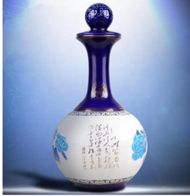
Fig. 1 Fenjiu Celadon series packaging design

Figure 1 shows the Fen Liquor Celadon series packaging design.