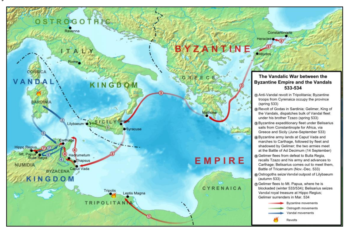
Figure 2. Vandal and Ostrogothic Kingdoms and Byzantine Empire

of history and became a disputed land and the main battlefield for the Vandals, Goths, and the Byzantine Empire, which did not leave its economy and population untouched (Pace, 1949: 81-134; Mazza, 1997-1998: 107-138; Manganaro, 2010-2011: 124-125) (Fig. 2).