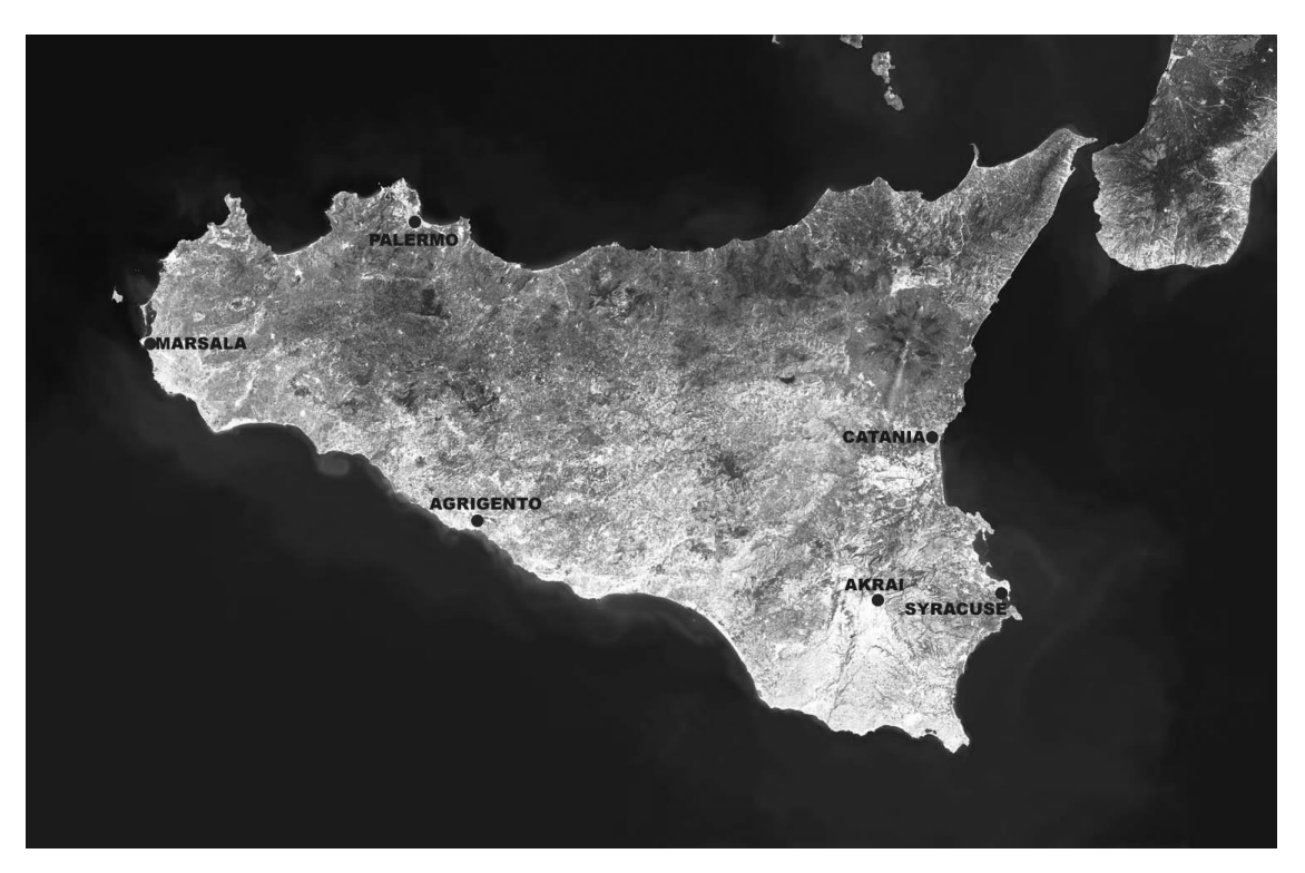
Figure 1. Map of Sicily with ancient towns mentioned in the text (based on Google earth, redrawn by R. Chowaniec)

barbarians trespassed deep into the Empire for good. Simultaneously, the first Roman province, Sicily (Fig. 1), remained far to the south from these events. As the largest and most centrallypositioned island in the Mediterranean Sea, rich in natural resources and playing a key role in political shuffles, it was a natural crossroad of trade routes, a melting pot of diverse cultures, a core of socio-economic development, as well as a 'desired' land, offering what other regions could not provide within hand's reach. Sicily supplied Rome mostly with grain, but also honey, cheese, olives, lead, alum, and salt (Peña, 1999: 57-59, 63–65; Vaccaro, 2013: 267–269; Chowaniec, 2017: 24–26). Thus, there were many reasons why history left its mark on Sicily, including the events of Late Antiquity - a time of turmoil, strife, division, and the fall of the Western Roman Empire (the historical and archaeological background: Cameron, 2012).