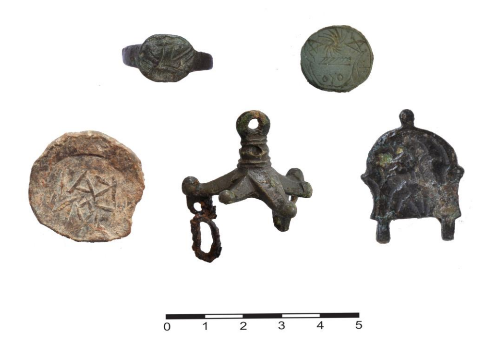
Figure 3. Some archaeological finds of Byzantine origin from Akrai/Acrae, south-eastern Sicily